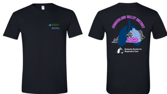
Crystal Buck @Crystal-Buck-2